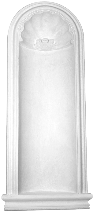
N-8 a=51" b=21" c=6"