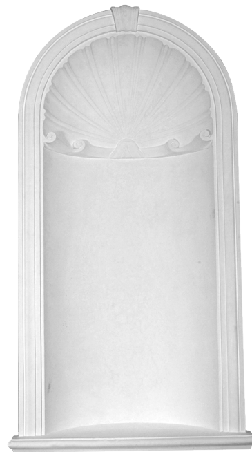
N-10 a=42" b=22" c=6"