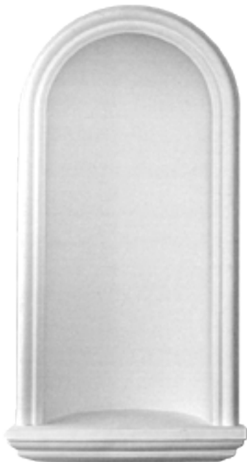
N-9 a=50" b=25" c=9"